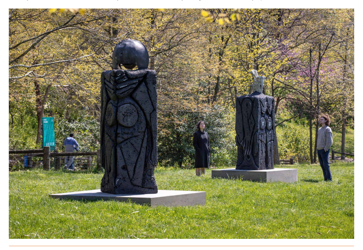
Huma Bhabha: Before The End, Courtesy of the artist; David Zwirner; Kiran Nadar Museum of Art, New Delhi. Presented by Public Art Fund at Brooklyn Bridge Park, New York City, Apr 30, 2024 – Mar 9, 2025.