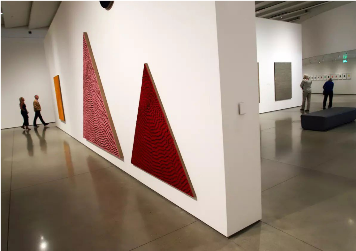
Guests walk through the "Jennifer Guidi: And so it is" exhibition of sand-and-acrylic creations at the Orange County Museum of Art in Costa Mesa on Sept. 14. Guidi's works will be on display through Jan. 7.

ations build on the practices of artists such as Agnes Martin and Georgia O'Keefe. The show includes what have come to be the six segments of the artist's practice; sand mandalas, universe mandalas, landscapes, shapes, drawings and sculpture. The works are expansive, technicolor dreams layered with meaning and mysticism.