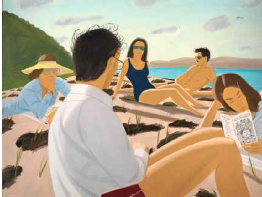
"Round Hill," 1977. Art work © Alex Katz / ARS

contrast, profiteering digital sideshows put art to death.