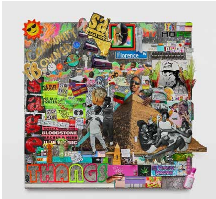
" thou shall not fold, " 2022. Art work by Lauren Halsey / Courtesy David Kordansky Gallery

In our current art world, the certainty of missing something has become inevitable. One contributing fact is that the connoisseur class, collectors and museum curators alike, insist that the art-fair circuit—essentially a farcically far-flung and fast-paced shopping spree—is a vital context for art. In 2022, galleries schlepped their wares to fairs in Basel, Dubai, Hong Kong, London, Miami, Paris, and Seoul (a very incomplete list). Six landed in New York City in May, with five more stuffed into the already hectic first week of September, the official kickoff of the new art season. The Oxford Dictionaries Word of the Year is "goblin mode" (whatever that means), but, for this manic pursuit of blue-chip trophies and next big things, I'd swap in a phrase coined by Schjeldahl, years before the scene reached its current warp speed: "festivalist slambang." You don't have to pay attention to fairs to feel overwhelmed by what you won't see. Per a study commissioned by the de Blasio administration, in 2015, there are some fourteen hundred galleries in the five boroughs, not to mention scores of museums. Following are a few highlights of my hyperlocal year in the trenches.