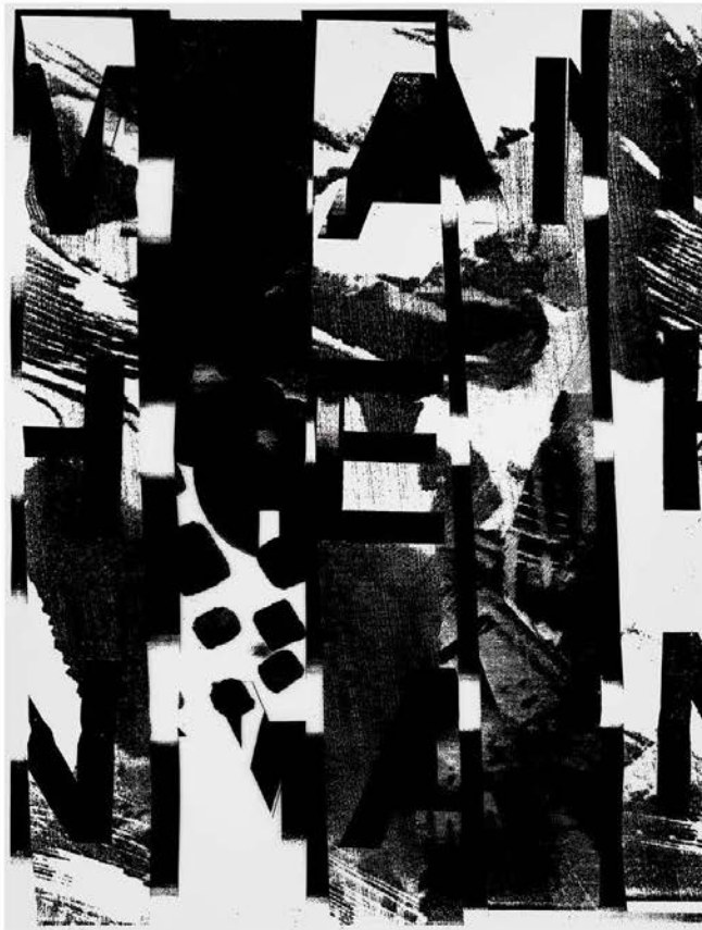
"a woman on the train asks angela davis for an autograph," 2014.

note-taker. I'm always writing down visual ideas. These things I write down, or take photographs of, often find their way into a work. My work life is very ordinary. I'm a 9 a.m. to 9 p.m. kind of person. I get up and go to work like anybody else, I probably just stay longer. I never wait for inspiration. You have to claim it. You can't wait for anything.