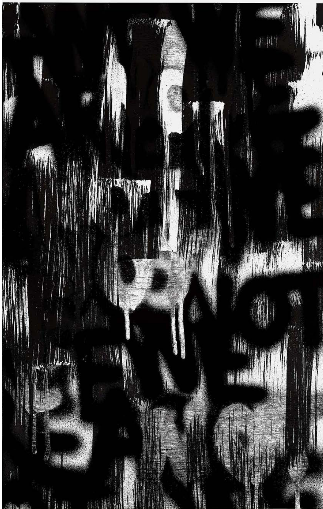
"Untitled (We Are Nos)," 2020.