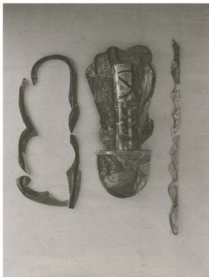
Betty Woodman, Balustrade Vase 04 - 4, Gauguin #1, 2004. Glazed earthenware, epoxy resin, and lacquer, 60 x 40 x 10 inches.