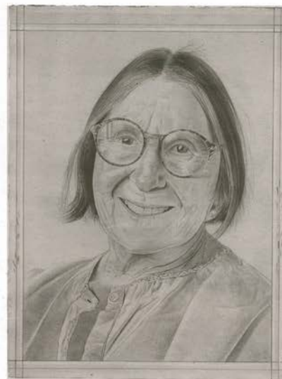
Portrait of Betty Woodman. Pencil on paper by Phong Bui.