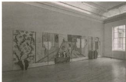
Betty Woodman, The Summer House , 2015. Glazed earthenware, epoxy resin, lacquer, acrylic paint, canvas, and wood, 338 1/2 x 92 1/2 x 12 inches. Courtesy the artist. Photo: Mark Blower.

those scraps of clay that became the wall pieces. It's similar to the space that I've explored for years and years between artist and craftsman, which is both interesting and challenging, and I don't think that one thing is inferior to the other. Each has a different goal, a different function. It's my responsibility how and where my work is viewed in different contexts.