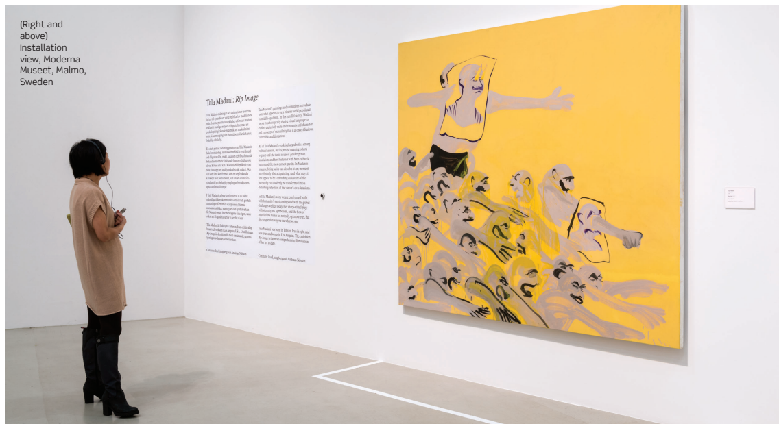
(Right and above) Installation view, Moderna Museet, Malmo, Sweden