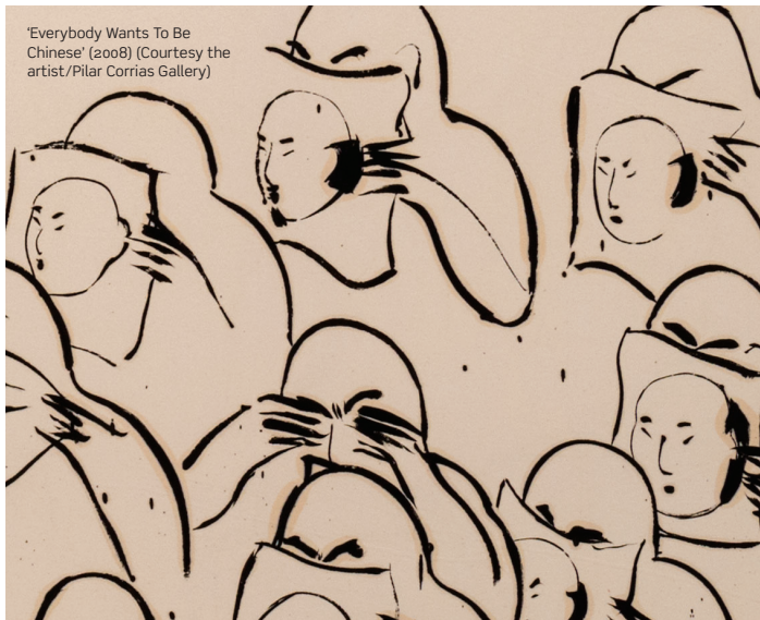
'Everybody Wants To Be Chinese' (2008)

Although she uses humour as a point of entry, and subjects are simply depicted with thin brush strokes and perhaps caricatures of who they really are, to approach these works from a single perspectival view, leaves the viewer confused, dumbfounded and as whimsical as the men being portrayed. HBA