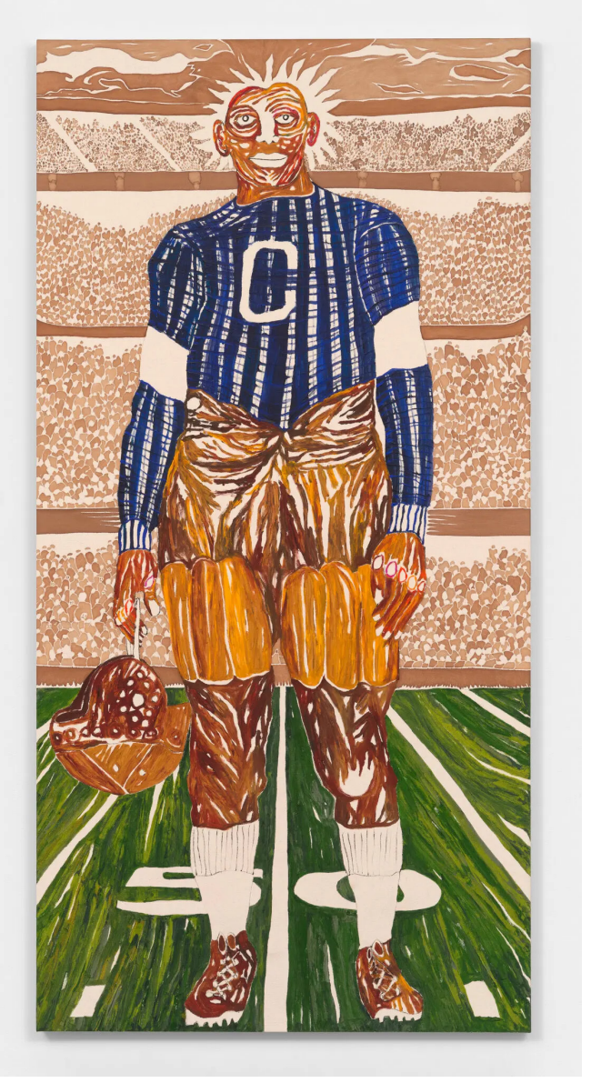
"End of The Half," 2024 David Kordansky Gallery.