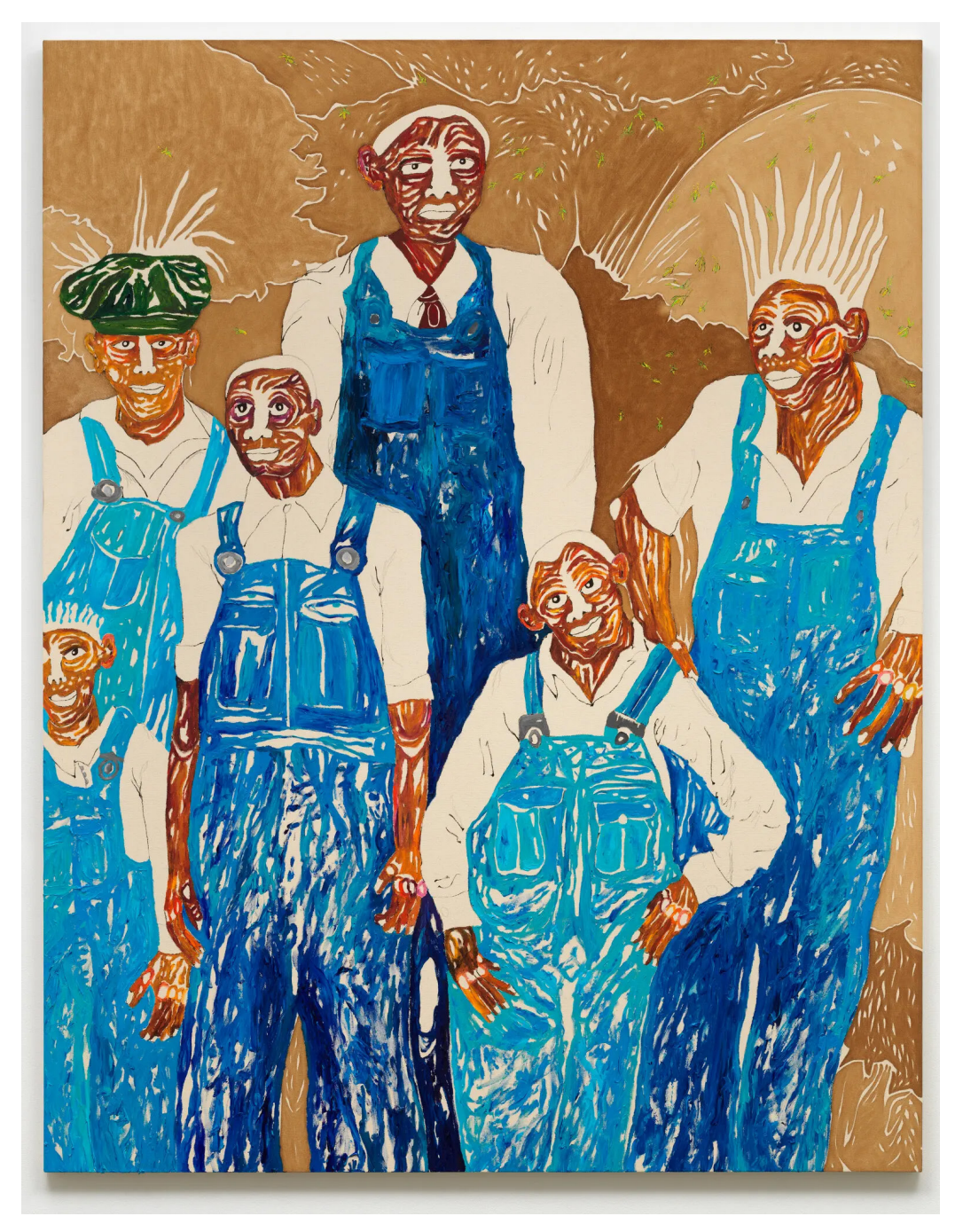
"Over All Else (Fireflies)," 2024 David Kordansky Gallery.

And the people he paints — whether a jazz musician or a Tuskegee Airman — have their own dashing quality and dignity as well as a quiet complexity.