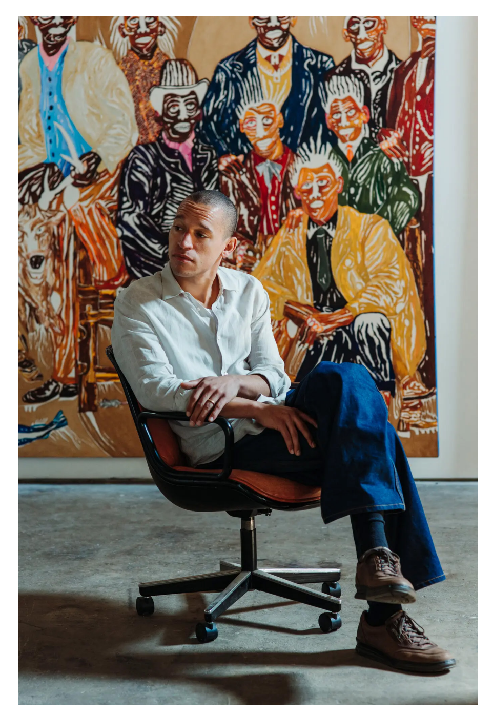
Some of his works are in the collections of the Whitney, the Walker Art Center and the Los Angeles County Museum of Art.

intense conversations with both my mom and dad over the last five, 10 years that have allowed us to all start healing and grieving and thinking about the next chapter of our lives with the baby.