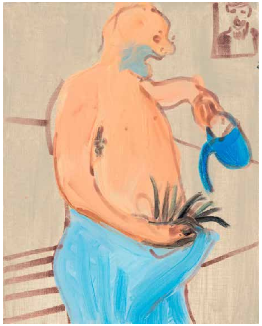
'Bouquet' (2006)