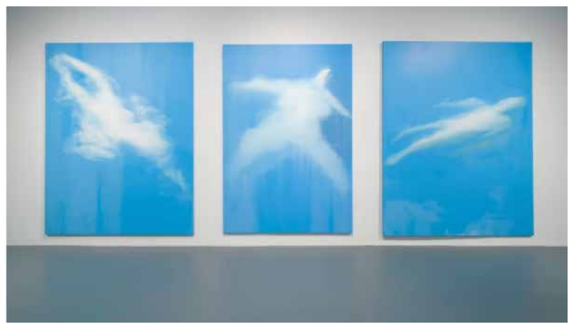
Three works from Madani's 'Cloud Mommies' series

A giant painting of a smiling, saluting police officer greets visitors to Biscuits , his features rendered in crisp outline and his uniform a mass of furious blue scribbles. "Perfect Copy" (2022) is based on a colouring-in exercise Madani's daughter brought home from school. Through Madani's ironic transposition, this icon of state authority is humbled by a little girl and her mother. The canvas's monumental scale is conceptual; at more than 14ft wide, it signals the seriousness with which Madani approaches what many consider the artless, silly, or infantile. It sets the tone for the exhibition.