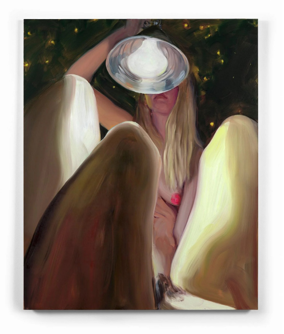
Jenna Gribbon, Bioluminescencescape (2021). Oil on linen. 203.2 x 162.5 cm. Courtesy the artist, MASSIMODECARLO and Fredericks & Freiser, NY. Photo: Todd-White Art Photograph.

Early on in my exploration of more sexual subject matter, I really enjoyed making very sexually explicit paintings very tiny