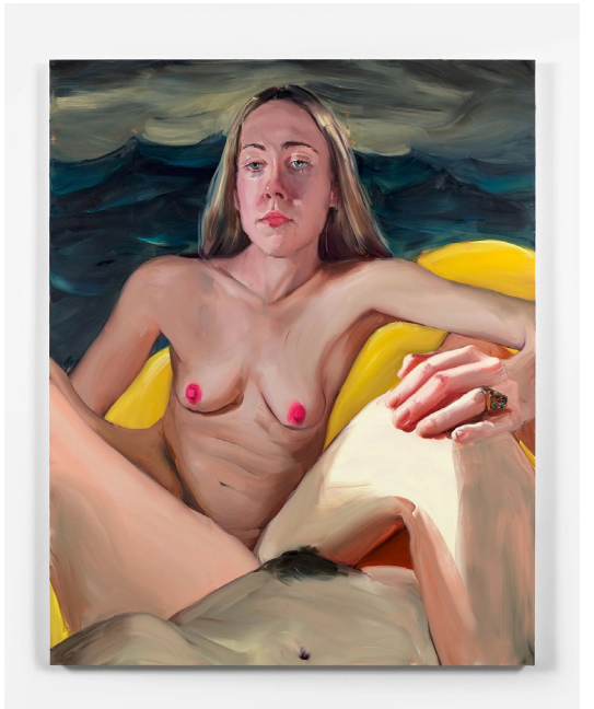
Jenna Gribbon, Stormy sea tropescape (2021). Oil on linen. 203.2 x 162.5 cm. Courtesy the artist, MASSIMODECARLO and Fredericks & Freiser, NY. Photo: Todd-White Art Photography.

They should dwarf the viewer a little bit. Even though they're nude, I don't think of them as sexual. They're more like landscapes or entanglements. In the case of these 'scape' paintings, it's parts of my body entwined with my partner's body but they're in kind of impossi-