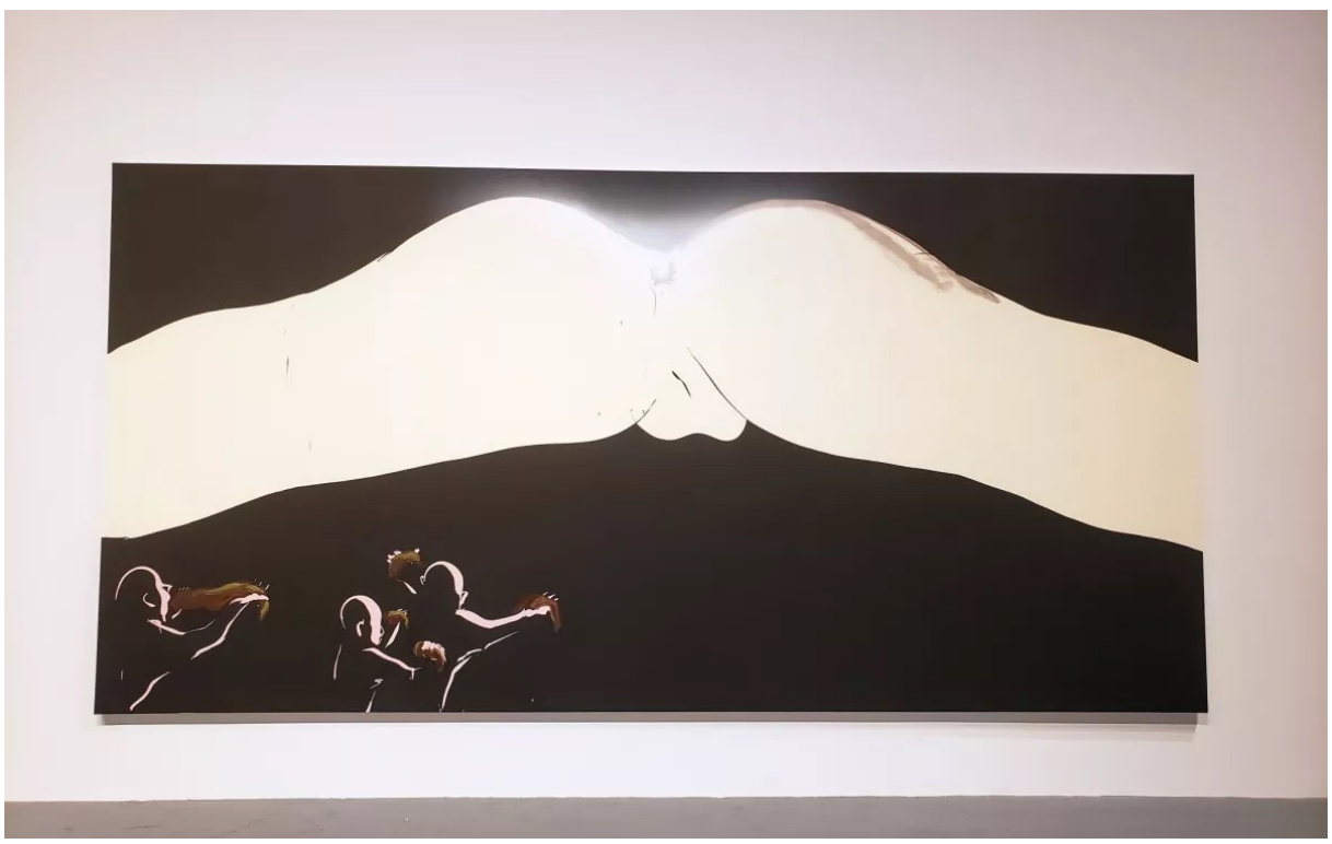
Tala Madani, "The New Landscape," 2022, oil on linen.

tional projection of feminine traits onto landscape, starting with Mother Nature, is replaced by a man's gaping anus. The hands of the fellows reaching out toward it are covered in a mud of feces.