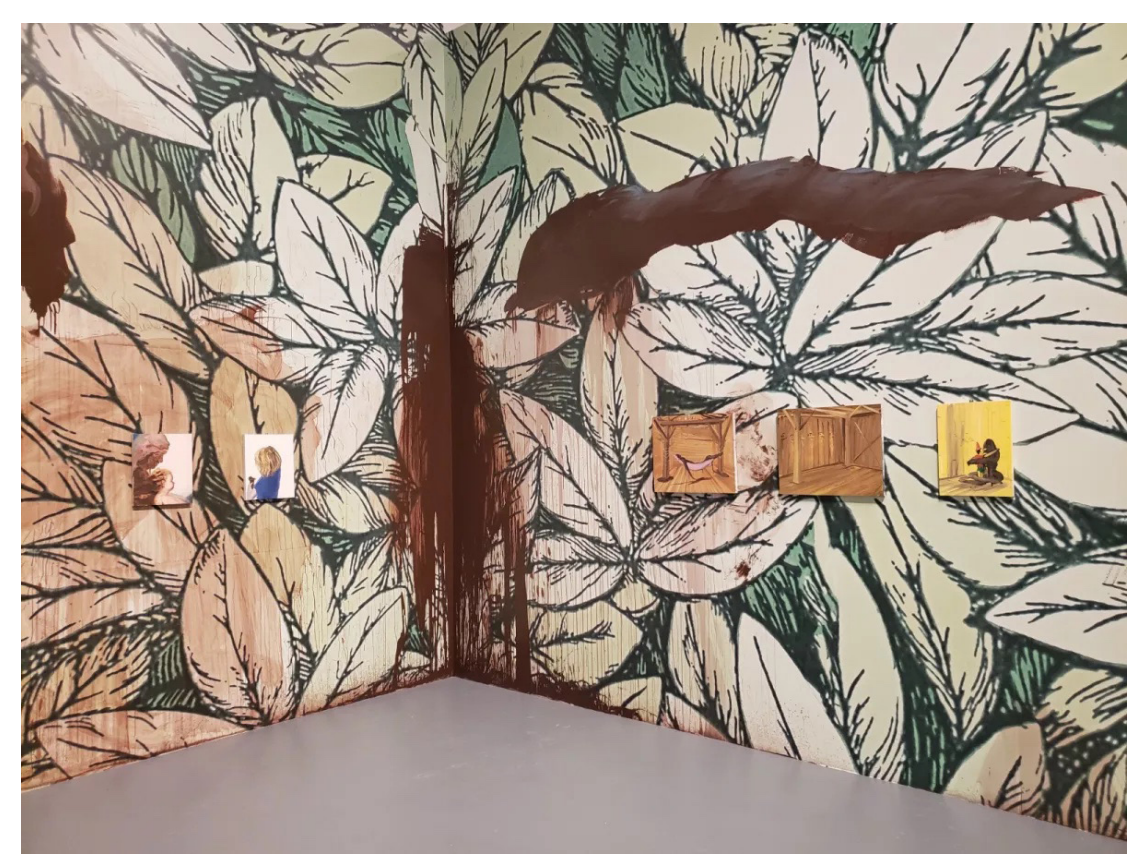
One room of the MOCA show is wallpapered in a motif of enormous leaves, smeared here and there with giant slathers of fecal brown paint, on which paintings hang. (Christopher Knight / Los Angeles Times)

Madani's animations are drawn frame by frame, which gives them a jumpy, handmade feel rather than being the sleek product of corporate or desktop digital production. One room of the show is wallpapered in a printed motif of enormous leaves, smeared here and there with giant slathers of fecal brown paint, on which paintings hang. Eden proposed as a messy place of human creation comes to mind, albeit in a thoroughly secular way.