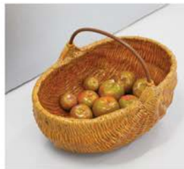
Installation view of Abnormally avid , 2019, glazed ceramic, copper wire, and plastic, basket: 35×48×36 cm and 14 apples: between 5-9 cm each, at "The Blazing World," Spike Island, Bristol, 2019.

The gallery became a stage for the performance The Blazing World (2019), in which dancers, donning animal masks, enacted ecstatic rites reminiscent of legendary sabbath gatherings, further elaborating on the convergence of woman with other. "Doing all this research," Perret told me, "one of the things that always came up was the proximity between the witch and the animals. [According to folklore,] witches were transformed into animals during sabbath. The judges that were persecuting the witches would also turn them into beasts. Basically, they were women but were not really human. The animal masks represent this transformation."