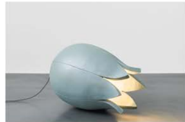
Installation view of The lantern's gone out! The lantern's gone out! , 2019, glazed ceramic, 72 × 48 cm, at "News from Nowhere," Simon Lee Gallery, Hong Kong, 2020.