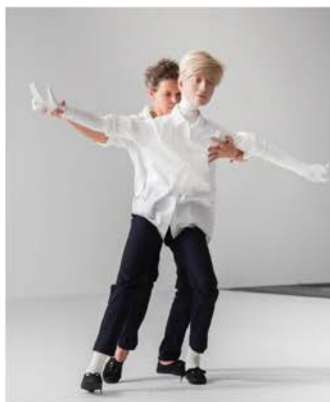
Photo of the performance Figures, 2014, at Biennale de l'Image en Mouvement, Centre d'Art Contemporain, Geneva, 2014. Courtesy the artist and Simon Lee Gallery, Hong Kong / London / New York.