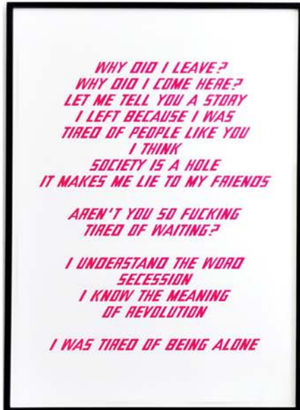
Society is a Hole, 2009, screenprint on paper, 83.8×59.4cm.

A blazing asteroid hurtles across the sky, alarming three dinosaurs who stand immobile as devastation looms on their horizon. The tyrannosaurus, mouth agape, exclaims, "Oh shit! The economy!!" A Covid-19-era internet gem, this meme's witticism strikes home as the pandemic's death toll rises daily while world leaders wring their hands about shrinking GDPs. Clearly, our priorities are all wrong. If we were to cast our myopia in a more generous light, however, it might look like our fault is that we are hopeful creatures. We believe we will survive. The optimistic among us view existential crises as opportunities to not only right our wrongs but to improve our lives. I, for one, have found myself asking the question: how can we rebuild societies so that they are better than before? Are we at the crossroads between utopia and dystopia?