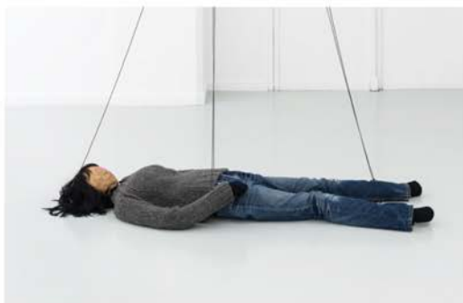
Installation view of La Fée Idéologie , 2004, mixed-media sculpture, dimensions variable, at "Yvonne Rainer Project," Centre d'art contemporain de La Ferme du buisson, Marne-la-Vallée, 2014.