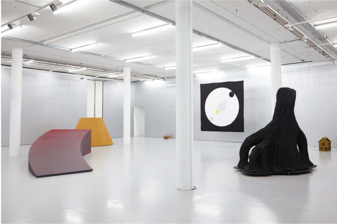
Installation view of "The Blazing World," at Spike Island, Bristol, 2019.