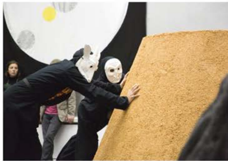
Photo documentation of The Blazing World , 2019, performance at Badischer Kunstverein, Karlsruhe, 2019.