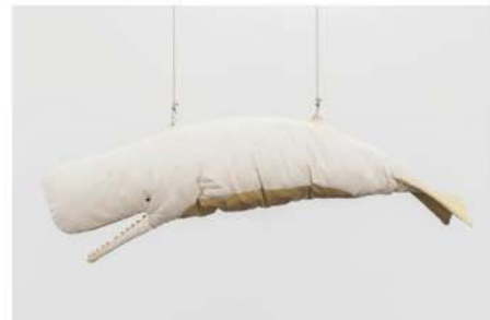
Leviathan II , 2013, canvas, leather, metal loops, wood, coconut fiber, and cord, 60 x 240 x 50 cm.