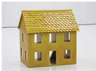
Installation view of A Magnetizer , 2019, glazed ceramic, 63×63×42 cm, at "The Blazing World," Spike Island, Bristol, 2019. Photo by Stuart Whipps. Courtesy the artist and Simon Lee Gallery, Hong Kong / London / New York.

The witch as a figure of the night, and, by association, alterity, is encapsulated in Mirror Logic (2019), a tapestry hung at the far end of the exhibition hall with multicolored circles abstracting lunar positions, while conjuring the etymological connection between "menstruation" and the Greek "mene," meaning moon. It was paired with a trapezoid-shaped mound, based on the kogetsudai (moon-viewing platform) of Zen gardens, which are designed to reflect moonrays.