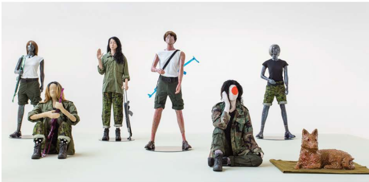
Installation view of Les Guérillères , 2016, mixed-media sculptures, dimensions variable, at "Féminaire," David Kordansky Gallery, Los Angeles, 2017.

This comes through in Les Guérillères (2016). Comprising a ceramic dog and mixed-media sculptures of women outfitted