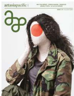
MAI-THU PERRET, Les Guérillères XII (detail), 2016, figure in steel, wire, papier-mâché, acrylic paint, gouache, synthetic hair, cotton and polyester fabric, bronze, polyester resin, ceramic, wool blanket and steel base, wood and steel chair, 135x63x75 cm.

Copyright © 2020, ArtAsiaPacific Holdings Ltd. All rights reserved. The opinions expressed are not necessarily those of the publisher. Material in this publication may not be reproduced in any form without permission. Requests for permission should be made in writing to: ArtAsiaPacific Holdings Ltd. GPO 10084 Hong Kong T +852 2553 5586 F +852 2553 1199 info@AAPmag.com