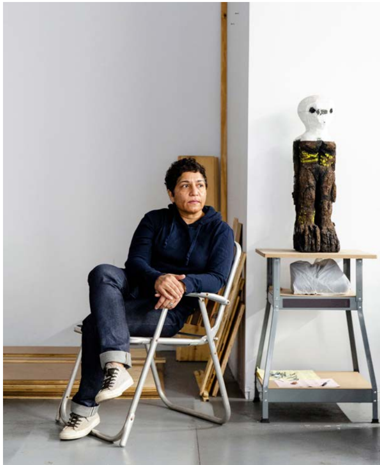
The artist Huma Bhabha photographed in her Poughkeepsie, N.Y., studio, alongside one of her sculptures.

The artist Huma Bhabha is preparing to ship a selection of her large-scale totemic sculptures across the country for an exhibition, and is eagerly looking forward to her studio being empty again. "When I'm working on a show and on a lot of cork sculptures especially, there's a lot of dust — and cleaning," she says, standing in front of a grand staircase that ascends, thanks to a quirky renovation, from the floor of her studio only to end at its ceiling. The cavernous 3,600-square-foot space, a former commercial building in Poughkeepsie, N.Y., is currently filled with otherworldly figures, their bodies hewn from ancient-looking cork or wood and adorned with swaths of pastel paint or swipes of nail polish. The works will soon leave for the David Kordansky Gallery in Los Angeles, where this month Bhabha will show a selection of new mixed-media sculptures and drawings that explore both ancient and contemporary approaches to depicting the body. During the course of her three-decade career, she has become used to these types of farewells.