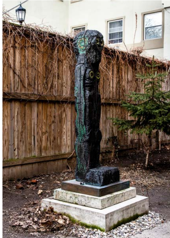
Bhabha's "Constantium" (2014), a bronze work marked by crevices and crude marks, lives in her backyard, and can be seen from her ground-floor window. Eva Deitch.

Every studio was good. I've had studios with no windows, but it all depends on what kind of work you get out of it. They were small. But even the studio that was a closed-in porch — it was tiny — there were some breakthroughs that happened for me there. So I think you can make work anywhere.