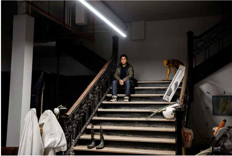
Bhabha sitting on the staircase of her vast main studio, located next door to her home.