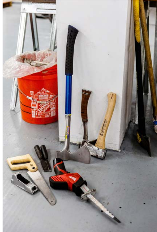
The artist's sculptural practice often produces a lot of dust — she works regularly with wood and cork — so she is ready to clean and start fresh after shipping her new works.