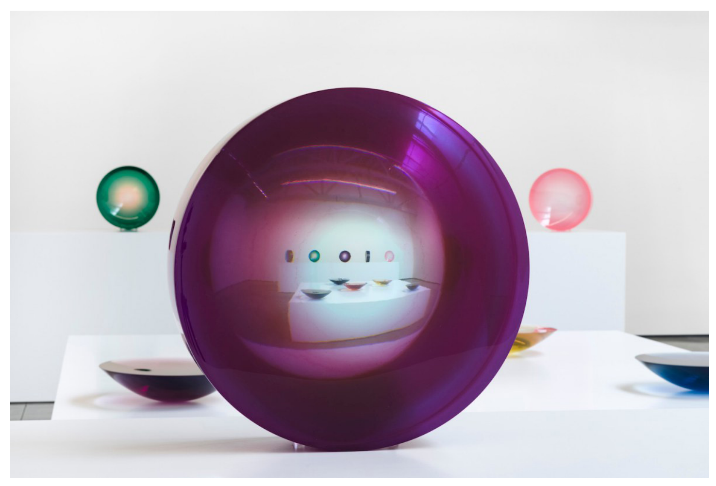
Installation view, Fred Eversley: Recent Sculpture at David Kordansky Gallery, Los Angeles

The exhibition's layout enhances the kaleidoscopic effects. The five horizontal lenses sit on a central table bookended by the parabolic lenses, which are displayed at varying angles on two long platforms; from almost any angle, the center of a lens captures the distorted images of the sculptures it faces, refracted onto its concave interior walls.