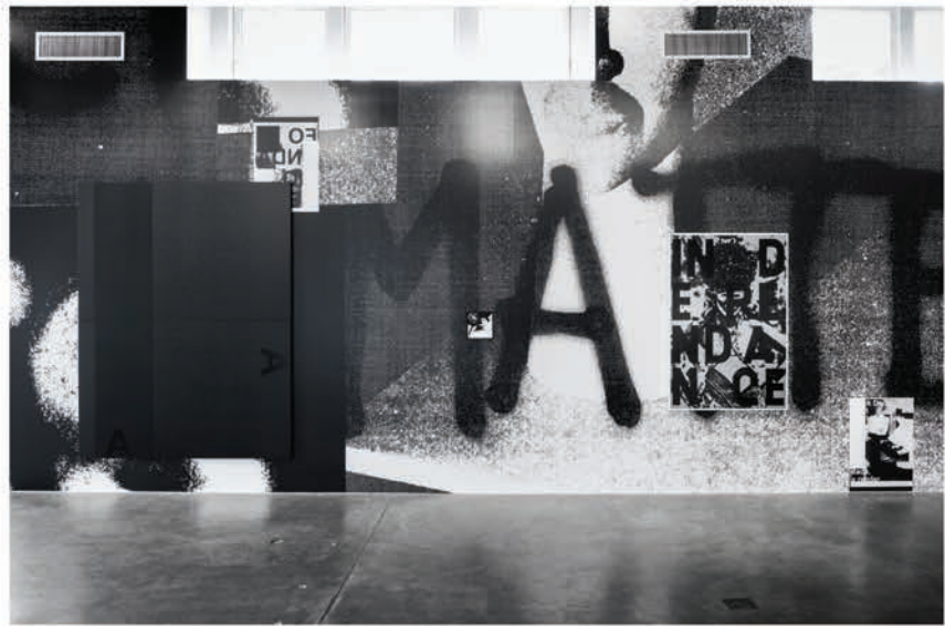
Installation view: Becoming Imperceptible , Contemporary Arts Center New Orleans, April 1 – June 1, 2016.

PENDLETON: That was when my own thinking about my work changed dramatically, yes. You have all of these ideas, and then you realize that what you make can't be a half-step toward those ideas. You actually have to manifest it. So I had this idea of taking a Southern-style religious revival, and turning it on its head, and then fusing it with experimental language. It was really that simple. I think it was the first time I had the idea to deconstruct, reconfigure, and reimagine an existing form and ask: what else could this be? What happens if you remove