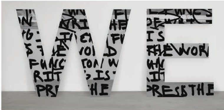
Adam Pendleton, WE (we are not successive) , 2015. Silkscreen ink on mirror polished stainless steel. 46 13/16 x 61 1/2 x 5/8 inches (W) 46 13/16 x 35 5/8 x 5/8 inches (E). Courtesy the artist.

What could I do that would actually change things around me, or change how we imagine the world and our built environment? Art was this thing that could shift attention.