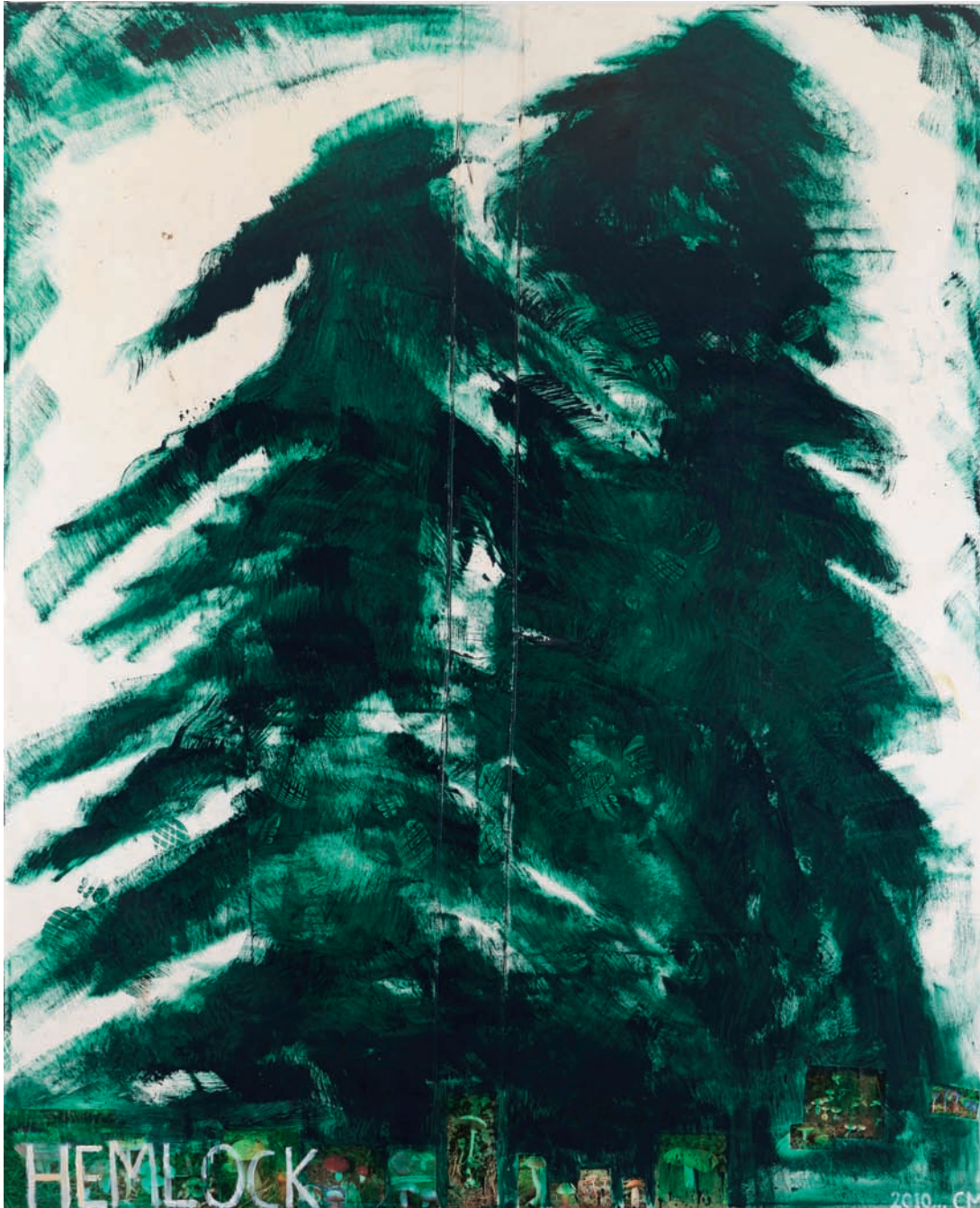
Hemlock , 2010, oil, gel medium and collage on canvas, 135 by 118 inches.

Princenthal, Nancy, "Wake-Up Call," Art in America , October 2011, pp. 124-131