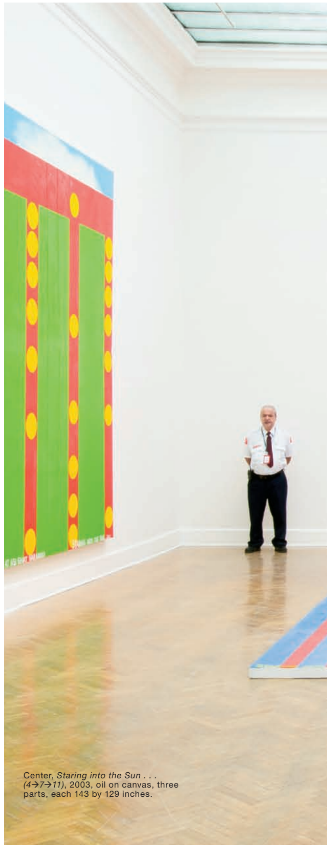
Center, Staring into the Sun . . . (4→7→11) , 2003, oil on canvas, three parts, each 143 by 129 inches.