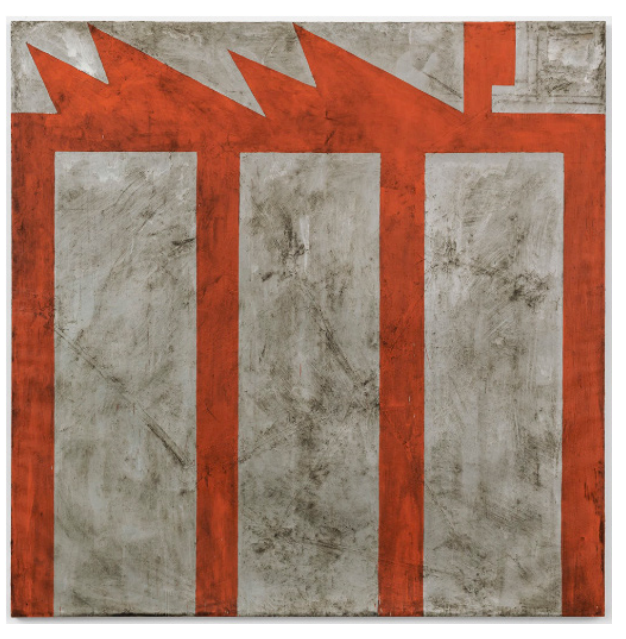
Chris Martin, Untitled, 1989.