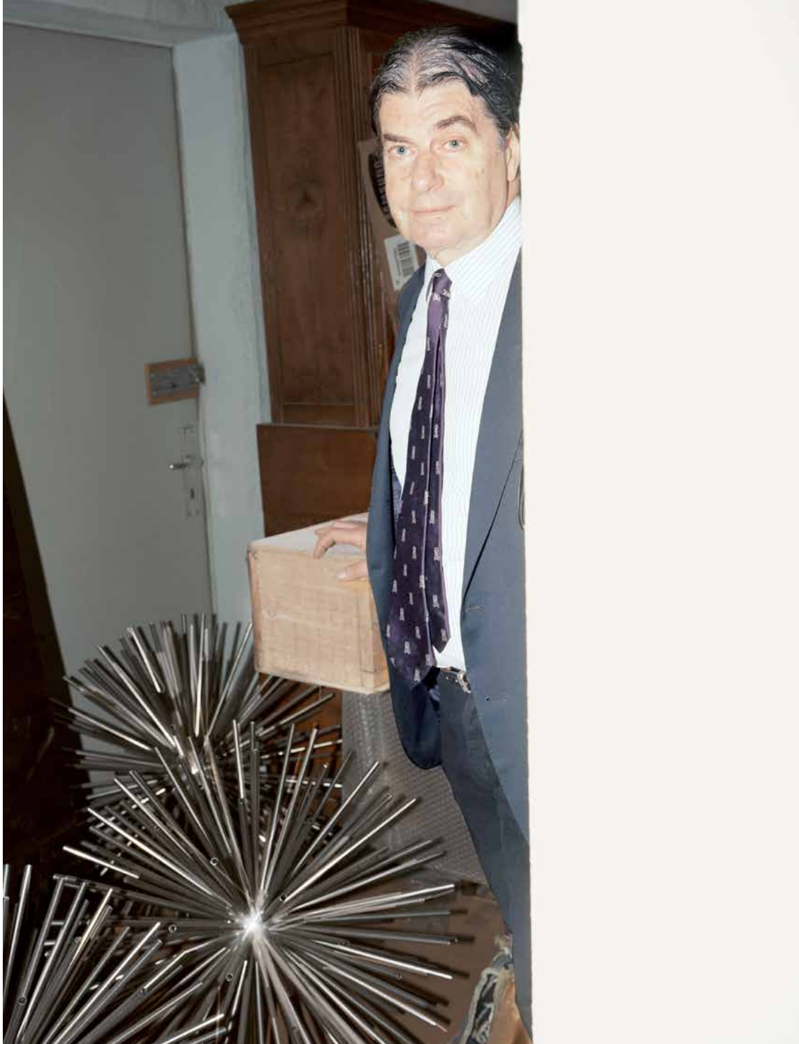
Bellini, Andrea, "Curated by John Armleder," Kaleidoscope , Issue 21, Summer 2014, cover, pp. 65-95