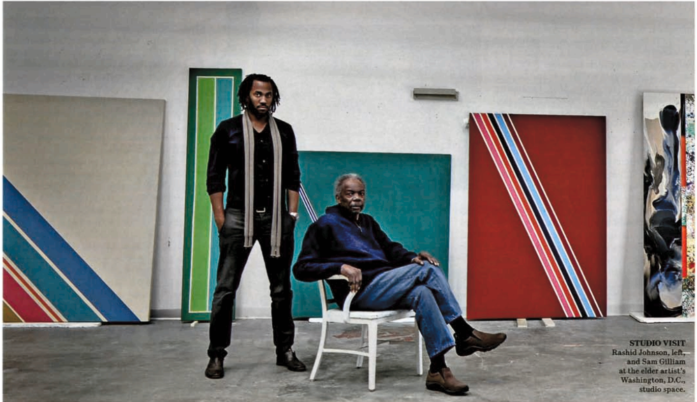
STUDIO VISIT Rashid Johnson, left, and Sam Gilliam at the elder artist's Washington, D.C., studio space.