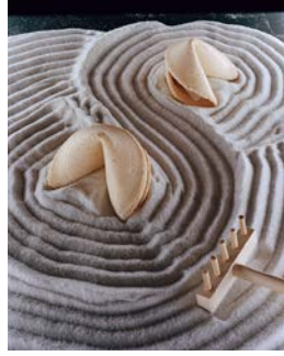
Torbjørn Rødland, Zen , 2014. Chromogenic print. 76 x 60 cm.

I've found that photographs from different genres can be extraordinarily generous with each other, and I've slowly expanded my range. I started out photographing myself in a landscape, moved on to landscapes with and without other people, and then onto buildings, still lifes, portraits, and body parts in rooms. If certain aspects of my production are getting more attention right now I think it is directly linked to a general absence of dreamed bodies in contemporary art. Viewers who mainly follow fashion have most likely not noticed this lack.