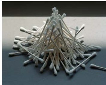
Torbjørn Rødland, Shadow Work no. 1 , 2014. Chromogenic print. 60 x 76 cm.