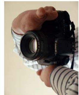
Torbjørn Rødland, The Photographer , 2015. Chromogenic print. 76 x 60 cm.

The world of Torbjørn Rødland is one of uneasy dreams. The Norwegian-born, Los Angeles-based photographer deals primarily in constructing and contrasting surfaces within the 2-D space: meat layered on skin; sunlight on hair; flesh touching flesh, reminiscent of the feral sensory play of Meret Oppenheim's fur-lined Object. A recent show of his work, at Albus Greenspon in New York, inspected the bizarre, fractured landscape of the human body, but another arm of his practice is reconfiguring banal, everyday objects into surreal tableaux: ratty hair extensions in a metal basket; withered sausage links encasing a slim, socked ankle; the swooping, reflective curve of a girl's pink hair contrasted with a patch of sober, pale shorn scalp.