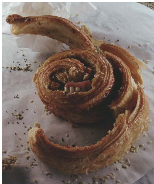
"Cinnamon Roll", 2015