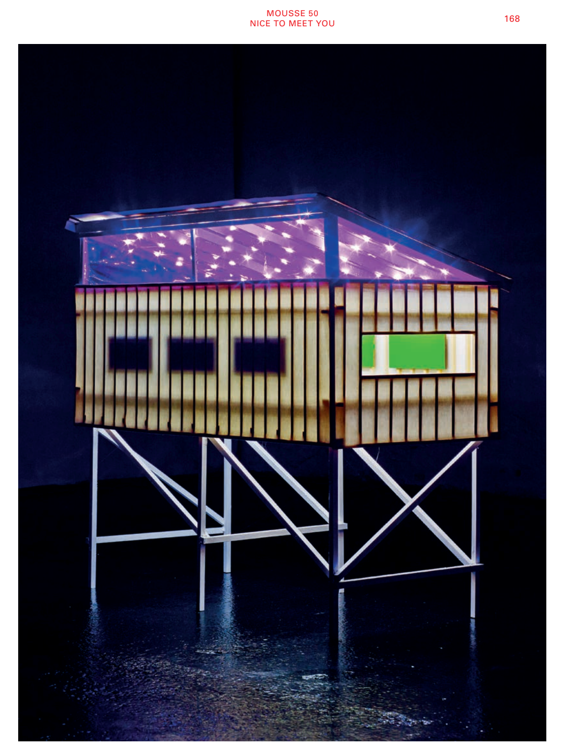
Structure with Six Green Calvins, 2014. Previous page - me with tongue, 2015.