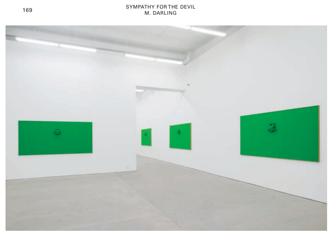
"Green Calvin" installation view at C L E A R I N G, New York, 2015.