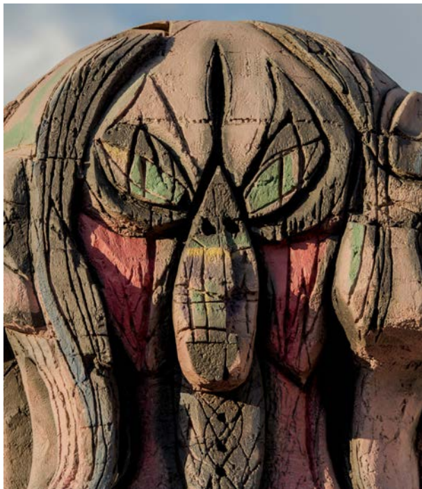
The bronze title figure is covered with patina color, and gouges that might read as cosmic wear and tear. Sci-fi aliens? Or contemporary updates of ancient Gorgons, warriors and spirits?