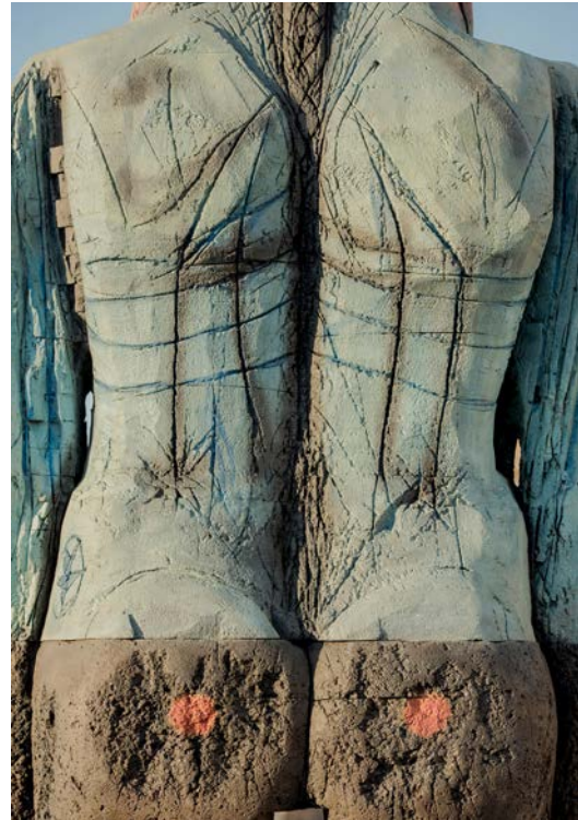
The bronze title figure is covered with patina color, and gouges that might read as cosmic wear and tear. Sci-fi aliens? Or contemporary updates of ancient Gorgons, warriors and spirits?

The second figure is more puzzling. Titled "Benaam," which means "unnamed" or "without name" in Urdu, its humanoid hands — which are reminiscent of Philip Guston's comic-inspired figurative painting — were carved in clay then cast in bronze. Its tail was crafted in phallic-looking coils of clay and was peppered with electrical conduits, all of which have been cast in bronze. The main element here — not entirely successful or exciting, for me — is a surface covering most of the figure that looks like a trompe l'oeil trash bag, cast in bronze and painted black. Is it a body bag? Maybe a burqa. Clearly something protecting, preserving or obscuring the figure.