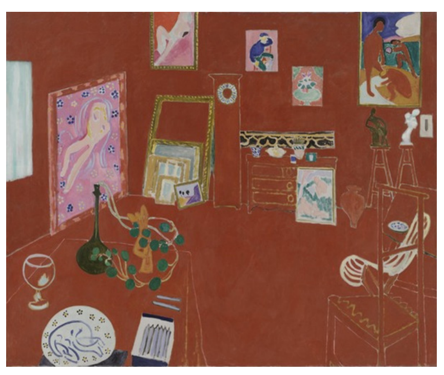
Henri Matisse, The Red Studio (1911). Courtesy of the Museum of Modern Art