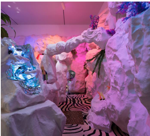
Exhibition view: Lauren Halsey: we still here, there, MOCA Grand Avenue, Los Angeles (4 March–3 September 2018).

In this conversation, Halsey talks about her love for South L.A., funk-as-architecture, putting the community at the front and centre of her art practice, and reimagining a future of Black greatness and generational prosperity.