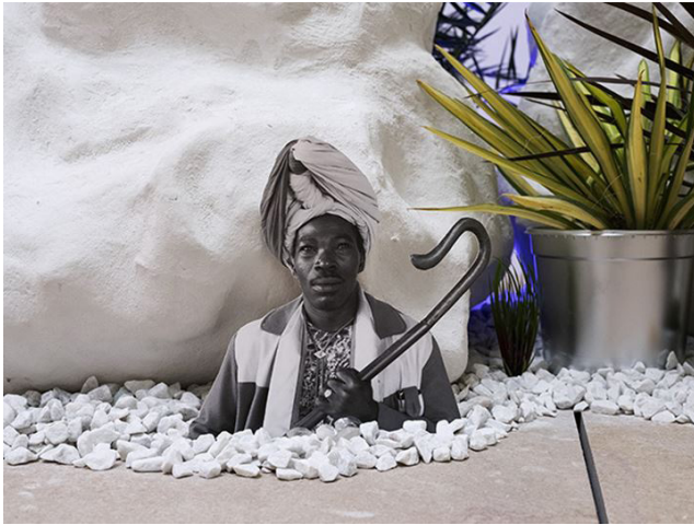
Exhibition view: Lauren Halsey, Open Space #5: Too Blessed 2 be Stressed! , Fondation Louis Vuitton, Paris (4 May–2 September 2019).