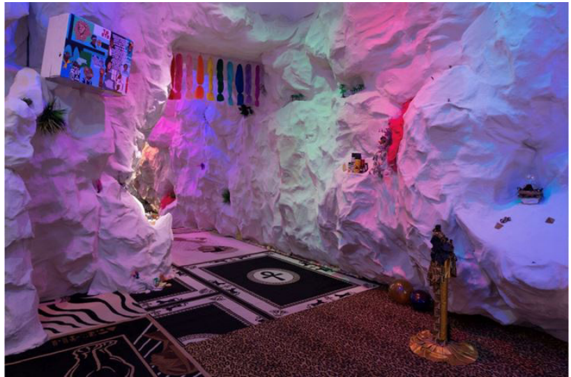
Exhibition view: Lauren Halsey: we still here, there , MOCA Grand Avenue, Los Angeles (4 March–3 September 2018).