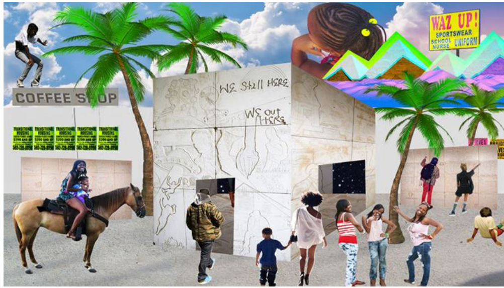
Lauren Halsey, South Central El Aye Hieroglyphic Fubu Architecture (Rendering I) (2015). Digital collage, dimensions variable.

I never imagined that the community centre would be producing and distributing 600 produce boxes a week for the neighbourhood for free. Managing a food assembly every Thursday has become my whole life. Before the pandemic, I had no clue that I'd be working in this way. We had planned to work on the garden, with children and young adults taking advantage of the space, and to roll out a programme of tutoring in the summer and fall.