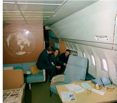
President John F. Kennedy flies over Passamaquoddy Bay in Maine, October 19, 1963.

Over the past couple years, I came up with this idea of trying to put myself, or the viewer, in the perspective of the decision-maker. In this case, we aren't in the Oval Office, but in Air Force One. John F. Kennedy was