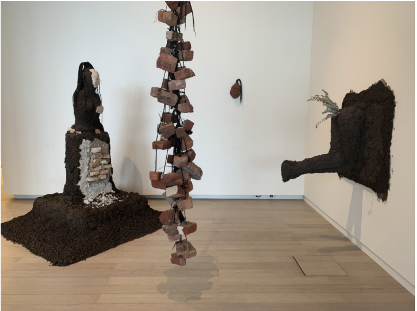
Installation view of Kiyon Williams's work

The class of 2019 is presenting works that inspire curiosity and fear — palimpsests for a generation still trying to understand itself.