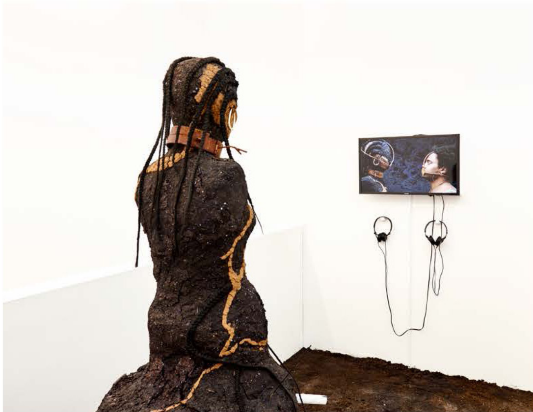
Kiyon Williams, Dirt Eater , 2019, installation views.