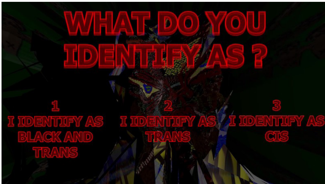
Danielle Brathwaite-Shirley: 'We are here because of those that are not/Blacktransarchive.com,' 2020

but, because there wasn't the advantage of choosing your identity, often people would come and just enjoy the work without thinking anything of themselves. I really wanted to put the viewer in the hot seat, making them notice their identity as well as making their identity determine accessibility and view-ability of the archive.