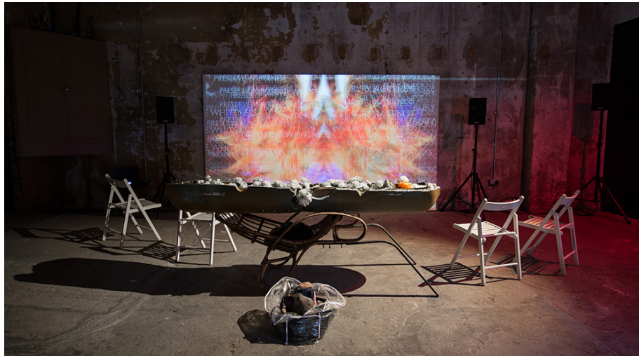
Danielle Brathwaite-Shirley, 'Digging for Black Trans Life' (2019). Installation view at BBZ Alternative Graduate Show.

Hart, Tamara, "Dining on trauma: Danielle Brathwaite-Shirley talks trans-tourism, motherhood, & being a 'Freaky Friday everyday'," AQNB.com , August 10, 2020