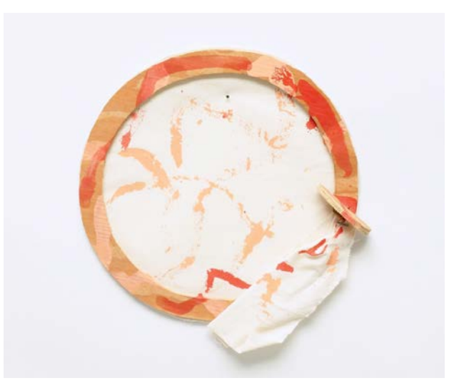
In23, 1998, acrylic, canvas and wood, 13¼ by 12½ by 2 inches.