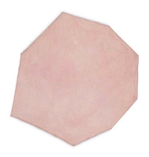
Purple Octagonal , 1967, dyed canvas and thread, 54 7/8 by 55 1/2 inches. Museum of Contemporary Art, Chicago.