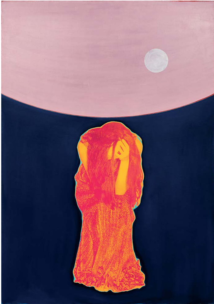
Mary Weatherford: Night and Day , 1996, oil and silkscreen on jute, 90 by 63 inches. PRIVATE COLLECTION.

of butterflies and moths, along with the actual shells of sea snails and starfish, onto her paintings' surfaces. Bearing a number of these smaller works, the "salon wall" in the Tang installation is itself a kind of bricolage installation.