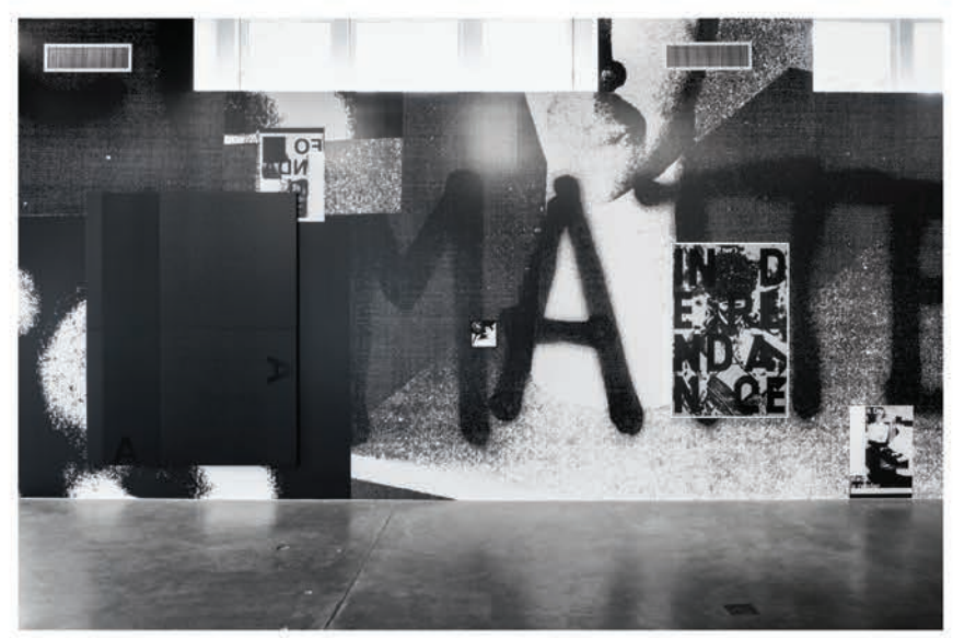
Installation view: Becoming Imperceptible, Contemporary Arts Center New Orleans, April 1 - June 1, 2016.

the religious aspect, but you leave the gospel music, the musical component? What happens if you take out the religious language and put in language that's related to queer activism or contemporary poetics? It was about creating a capacious space, breaking down one form and creating something else.