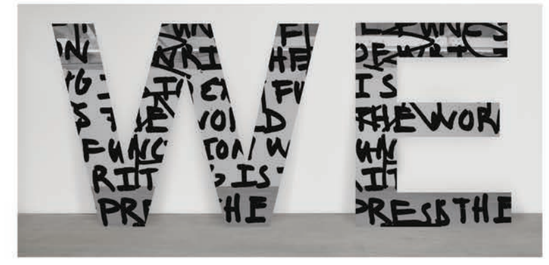
Adam Pendleton, WE (we are not successive), 2015. Silkscreen ink on mirror polished stainless steel. 46 13/16 × 61 1/2 × 5/8 inches (W) 46 13/16 × 35 5/8 × 5/8 inches (E).

What could I do that would actually change things around me, or change how we imagine the world and our built environment? Art was this thing that could shift attention.