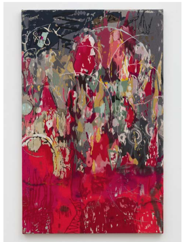
A True Tale , 2018. Thread and ink on canvas. David Kordansky Gallery

I shorten the stories down to a sentence or two. The information motivates my activity of sewing. I am still not completely sure about how to include the narrative, especially stories which transform and change with the person telling them. I'm not too invested in how the narrative is received. Retelling of information adds new layers.