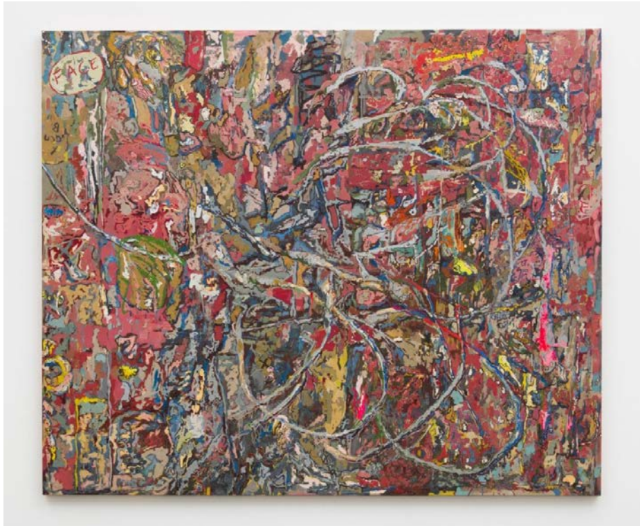
Fandango , 2018. Oil, wax, KY jelly and muslin on panel. David Kordansky Gallery

started to use decoratively. I am interested in combining cues from different periods to complicate the colours' relationship with time.