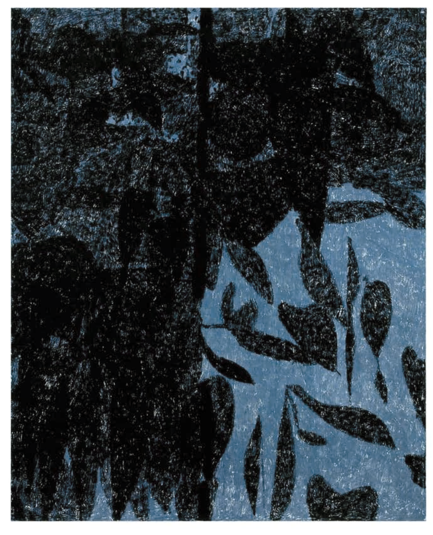
Left, As It's Its Own, 2011, oil on linen, 72 by 60 inches.