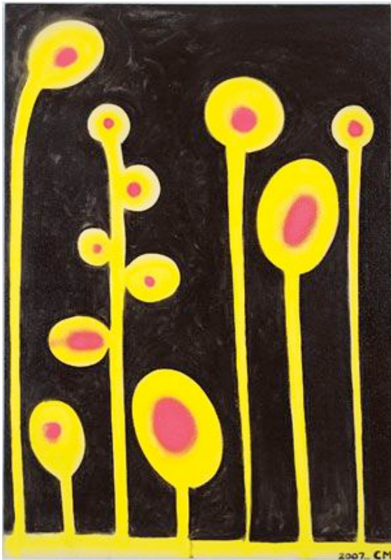
Chris Martin, "Untitled" (2007). Spray paint and oil on canvas. 43 by 30 inches.