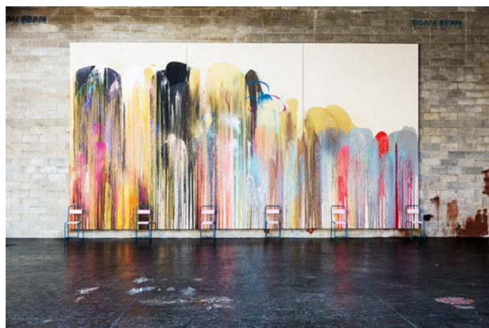
Medium Green , Woodland Scenics, Realistic Trees, 2014, furniture sculpture, three paintings and six chairs

JOHN ARMLEDER — If you look at me today, you'd wonder where the dandy thing went. The