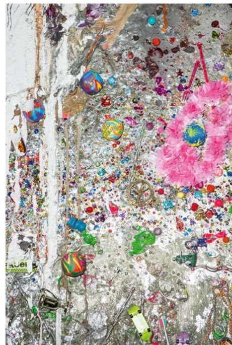
Onto a Bridge (detail), 2014, mixed media on canvas