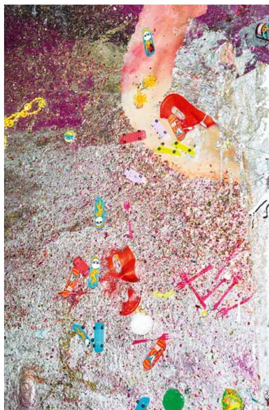
Onto a Bridge (detail), 2014, mixed media on canvas