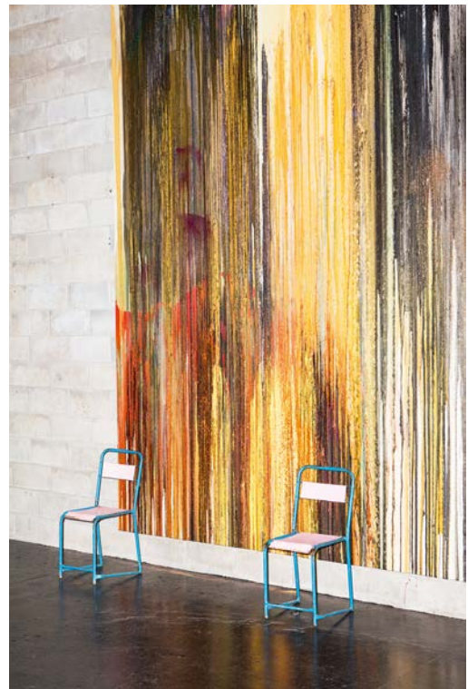
Medium Green, Woodland Scenics, Realistic Trees, 2014, furniture sculpture, three paintings and six chairs

JOHN ARMLEDER — Do you know the French composer Erik Satie, who created what he called furniture music? In a way, it was the precedent for ambient music. He would have musicians in different rooms playing the same