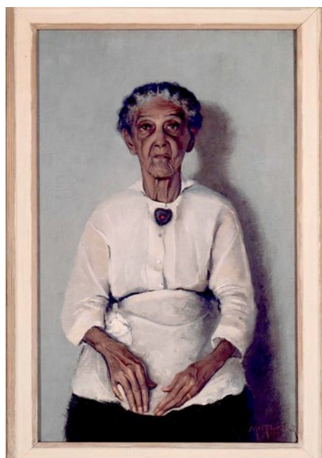
"Portrait of My Grandmother" by Archibald Motley.