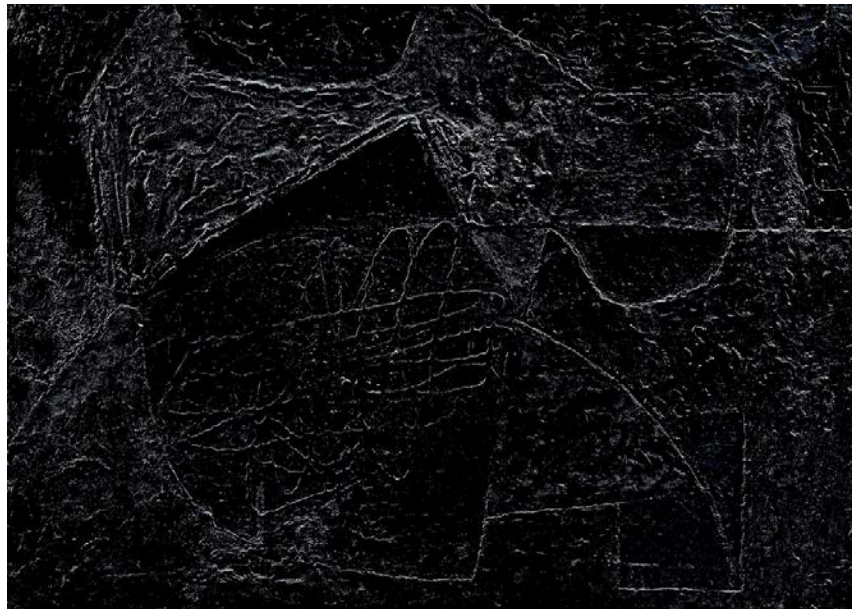
"Nero Catrame" by Alberto Burri.