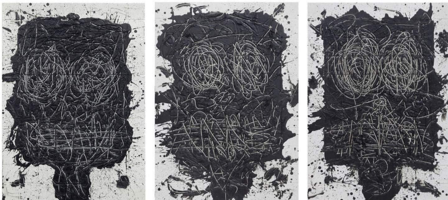
Three untitled works in "Anxious Men." Credit Rashid Johnson/Hauser & Wirth

"Anxious Men," an exhibition of work by Rashid Johnson, on display at the Drawing Center in SoHo through Dec. 20, combines scrawled drawings, undulating wallpaper, houseplants and a screeching soundtrack. It's a departure from the found-object assemblages with sensuous Shea butter that were the highlights of previous Johnson shows like "Message to Our Folks," a solo exhibition that originated at the Museum of Contemporary Art Chicago in 2012. This one-room installation is distinctly flat, which is not a slight. Through this visual flattening, Mr. Johnson compresses the history of how black identities are presented and perceived.