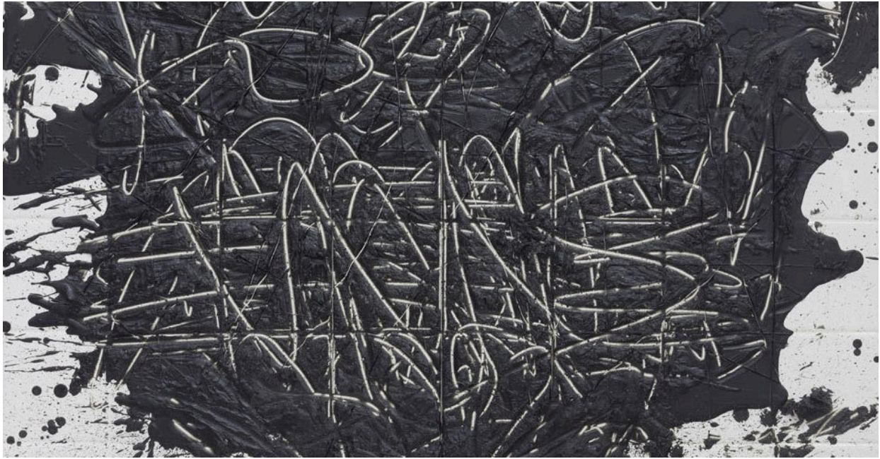
Detail of one of Mr. Johnson's untitled pieces from "Anxious Men."