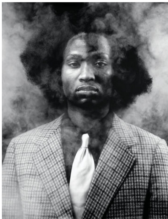
"The New Negro Escapist Social and Athletic Club (Thurgood)" (2008). Credit Rashid Johnson/Hauser & Wirth

Twelve untitled pieces in "Anxious Men" rely on the same basic motif: a rectangular head atop a spindly neck, round eyes bugging out, a gash mouth indistinguishably frozen between smile and grimace. They are not the polished intellectuals of his "The New Negro Escapist Social and Athletic Club" photographs or the graceful movers of his video "The New Black Yoga"; they are vulnerable men on the verge of a breakdown — messy, cartoonish, stressed out, brutalized.