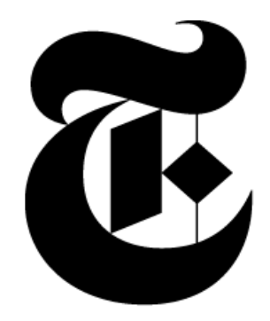
The New Hork Times Style Magazine