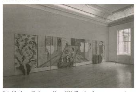
Betty Woodman, The Summer House , 2015. Glazed earthenware, epoxy resin, lacquer, acrylic paint, canvas, and wood. 338 ½ × 92 ½ × 12 inches.