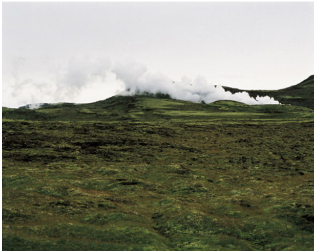
Burzum, 2002 [from "White Planet Black Heart"]

TR: Clinical melancholia is when your observations fail to inspire action. The world is there to be looked at, not to be lived in. French psychiatrist Pierre Janet studied and wrote about this. I was a melancholic teenager, and I put my defect to work. Go with your strength, right? No medium does melancholia better than photography.