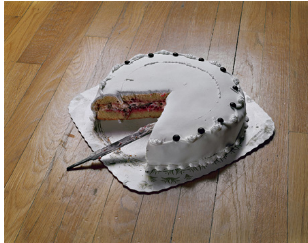
Cake, 2005 [from "White Planet Black Heart"] © Torbjørn Rødland

TR: I was completely bored with thematic photography books. They place too much focus on motifs. Ed Ruscha knew that the concept of Twentysix Gasoline Stations was ridiculous – that was part of the rebellion, what made it so good – but I find intuitive coherency much more interesting than seriality now. So I wanted to break with the "100-Somethings" or "Pictures-from-Somewhere" type of book. I wanted to make a book that continues to challenge, as you go through it. I wanted the logic of the book to be perforated – and therefore erotic.