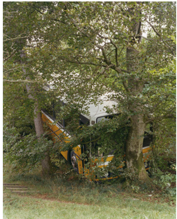
Bus, 2000 [from "I Want to Live Innocent"] © Torbjørn Rødland

TR: It's not really a goal for me to fully understand why I make an image a certain way or why I end up printing one negative and ignoring another. Combining the ones I like is a big enough task. This is a situation where the intellect is trying to comprehend the visceral. One way a photograph can be successful is if it's a surprising but precise take on something that you suspect could become your reality – and if you'd like to look at it again tomorrow. On the negative side, a photograph is clearly too ambiguous to constitute a precise critique.