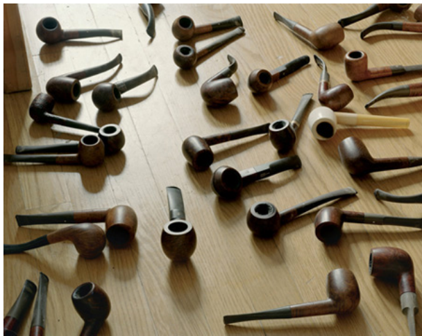
Pipes, 2005 [from "I Want to Live Innocent"] © Torbjørn Rødland

TR: An institution producing a catalogue for a show needs an authoritative text to justify their choices, but if a photographer is producing a project book I think they should be careful with text. Sometimes it's necessary, to open up a project, to help free it from conventional perception. An interview is always clarifying, but the three-page catalogue essays you see everywhere are no fun. I don't read them. They're like the liner-notes on LPs from the 1960s. You know why they're written, and they carry no weight. So yes, there's no writing in Innocent , but White Planet has three texts: two 'open letters' and one ambitious academic essay by Ina Blom.