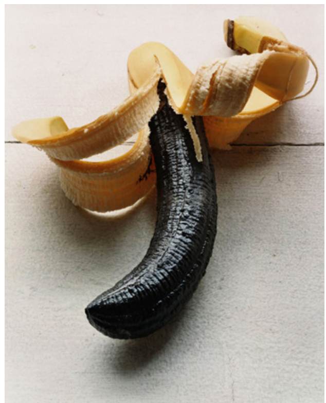
Banana Black, 2005 [from "White Planet Black Heart"]

TR: The first contemporary artists I could really relate to were Americans like Sherrie Levine, James Welling, Richard Prince, Cindy Sherman, all from "The Pictures Generation." So my starting point is the critical reconsideration of popular motifs or image types.