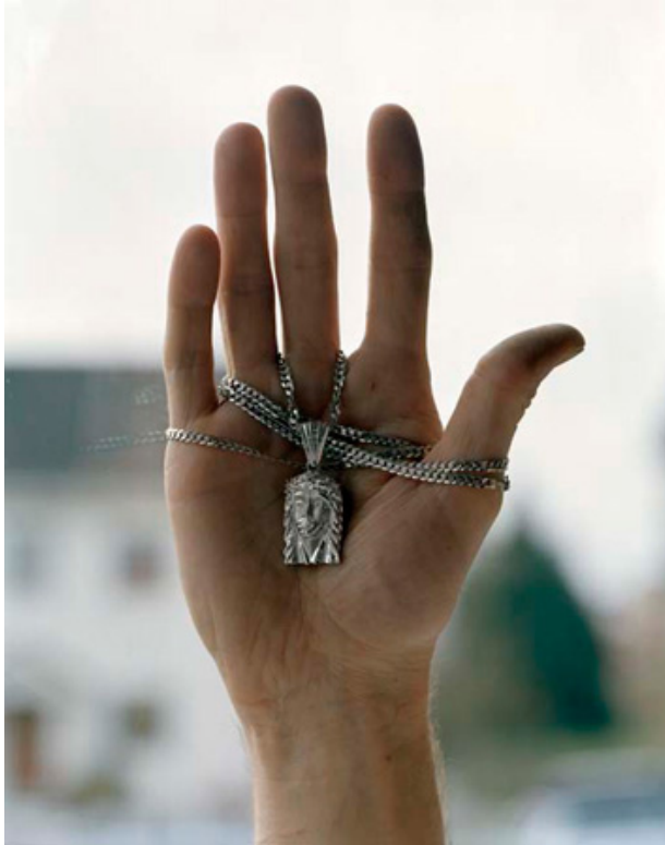
Hand of Hip-Hop, 2006 [from "I Want to Live Innocent"] © Torbjørn Rødland

SL: You've actually done some curating yourself. Tell me about the show you put together this past summer at STANDARD (OSLO) entitled "Tell Tchaikovsky the News."