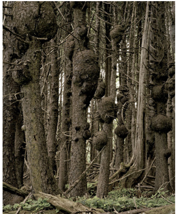
Burzum , 2002 [from "White Planet Black Heart"]

TR: I wanted to establish a wide perspective, and the title also indicates a conflict of sorts. The qualities I look for in a title are similar to those I look for in a photograph: it's not meaningful without an active viewer. You have to bring