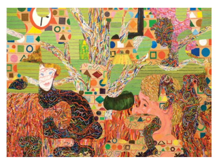
Jigslaw, 2009, oil on canvas, 64 x 96 inches.