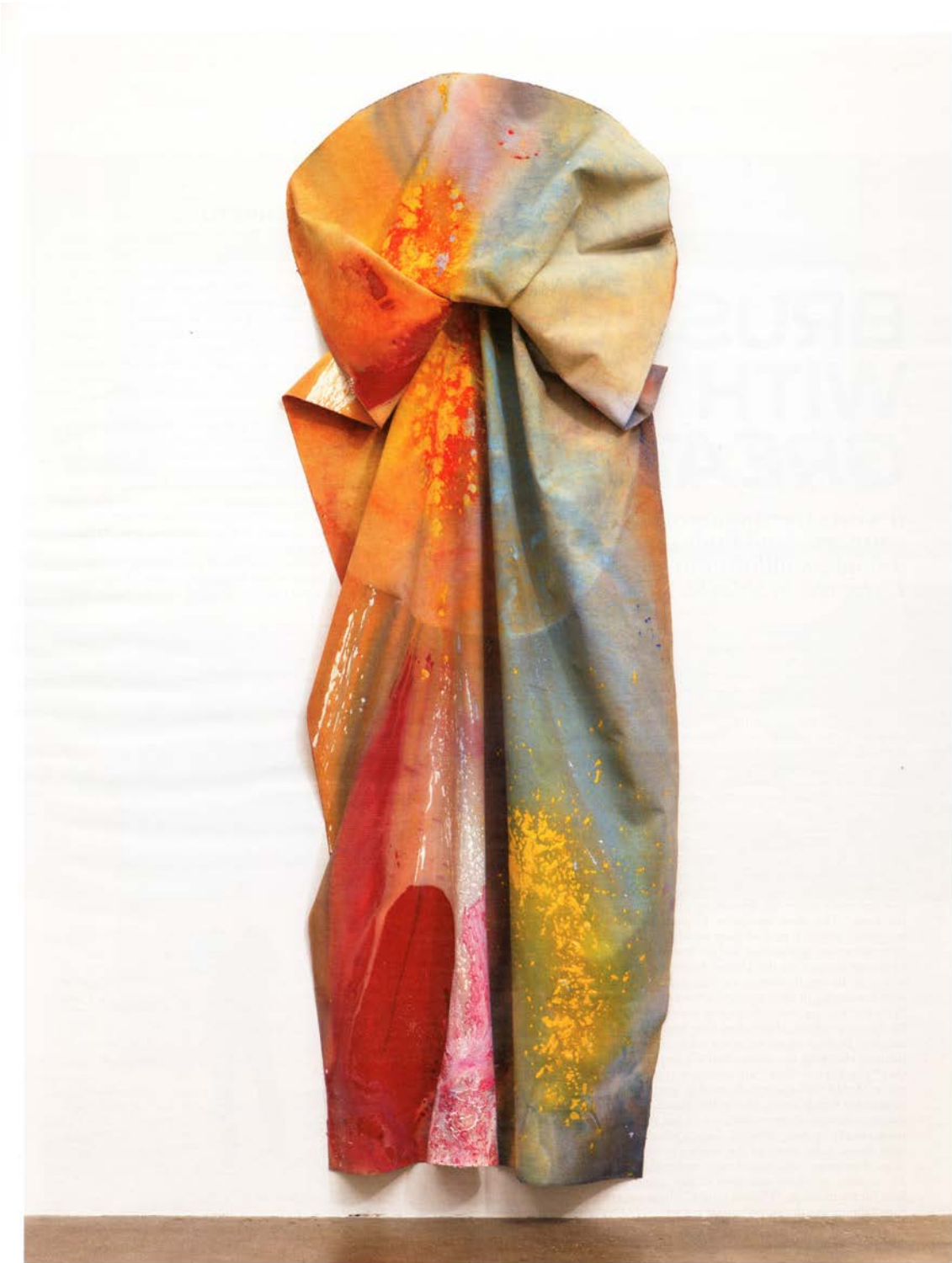
Lewis, Jim, "Red Orange Yellow Green and Blue Period," W Art , December 2014/January 2015, pp. 86-89