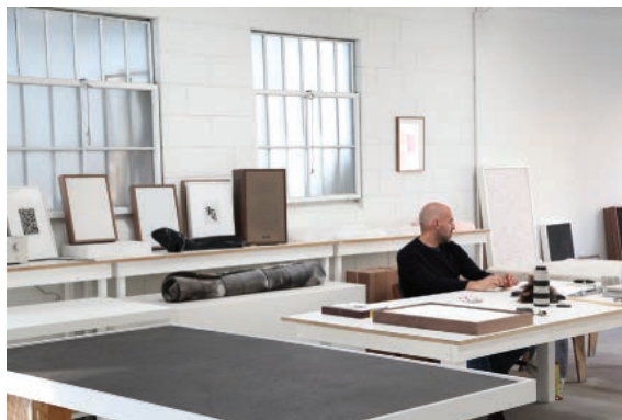
Clockwise from top left: Near the subterranean unisex vitality pool: Anthony Pearson, Untitled (Three Freestanding Pour Sculptures), 2012, bronze sculptures, 68 x 37.5 x 4 in. each. In the ESPA at The Joule lobby: Anthony Pearson, Untitled (Suite of Five Solarized Prints), 2012, solarized silver gelatin photographs in artist's frames, 17.5 x 13.25 x .75 in. each. Artist Anthony Pearson in his Los Angeles studio. Anthony Pearson, Untitled (Plaster Positive), 2012, hydrocal and oiled Claro walnut, 59.75 x 43.75 x 3.5 in.