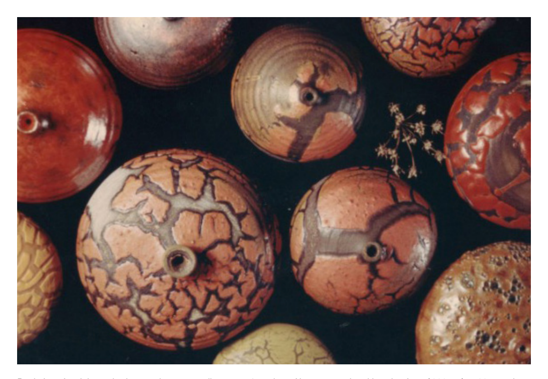
Doyle Lane's miniature bud vases, known to collectors as 'weed pots' have appreciated in value from $300 to $1,500 over the last decade. (Reform Gallery)

would be donated to an as-yet-unnamed Southern California museum. O'Brien was able to secure the mural in the interim and had it insured and installed at the Landing for the exhibition.